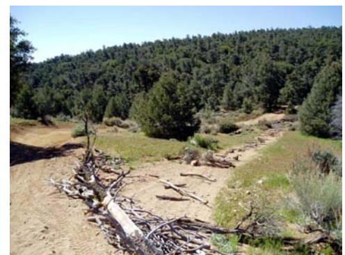
The "go around" was blocked off ... maybe they'll stay on the designated trail !!??